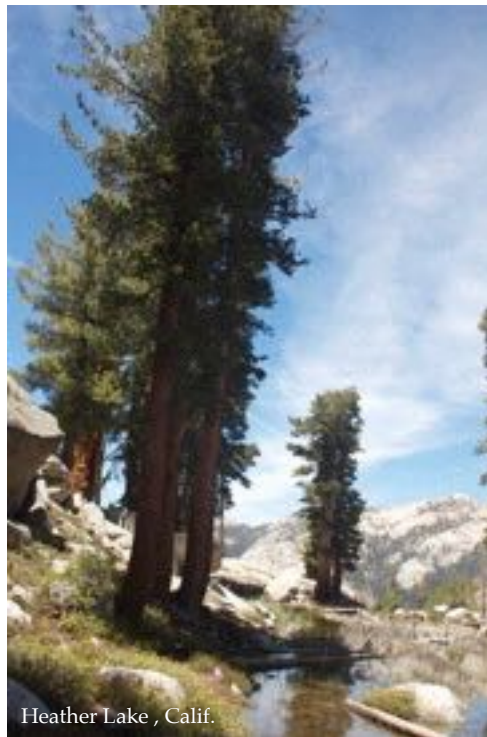
Heather Lake, Calif.

post . The vision started as a blogging series. I had also recently started work on a novel that is now in the final stages of its first draft. As I have pursued my goals over the last couple of years, I am finding this concept of ByTheWay weaved into every facet of my journey. As my goals expand and my vision for my career grows, so does ByTheWay. I'm leaning into this phrase to define my work. At least to date. It's the overarching theme of everything I do.