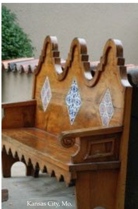
Kansas City, Mo.