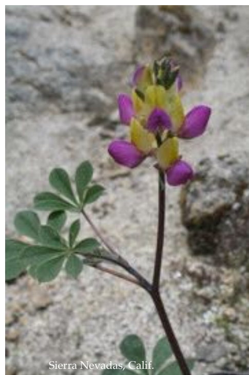
Sierra Nevada, Calif.

So what are the next steps? As I previously stated, I've been working on a novel. Right now, I am trying to get all my ducks in a row so that when it's completed, I will have a platform to market to. That's where you come in. My followers. My loyalists. I hope you will be there with me, in the end, when I finally get to announce it has hit the market!